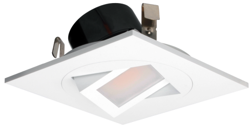
120V Triac Dimming Ver.

Use the switch to set the desired CCT (Correlated Color Temperature).