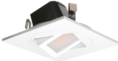
120-277V 0-10V Dimming Ver.